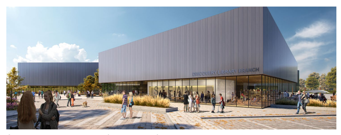
Original designer rendering of the outside of the building