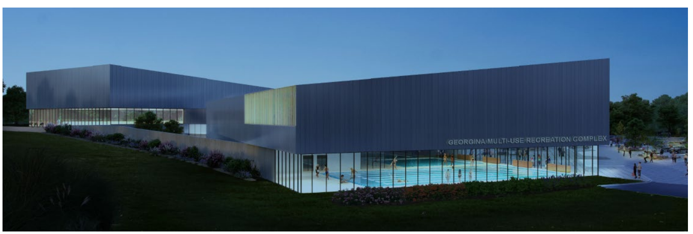
Original designer rendering of the outside of the building