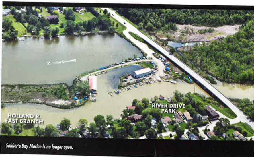
Soldier's Bay Marine is no longer open.