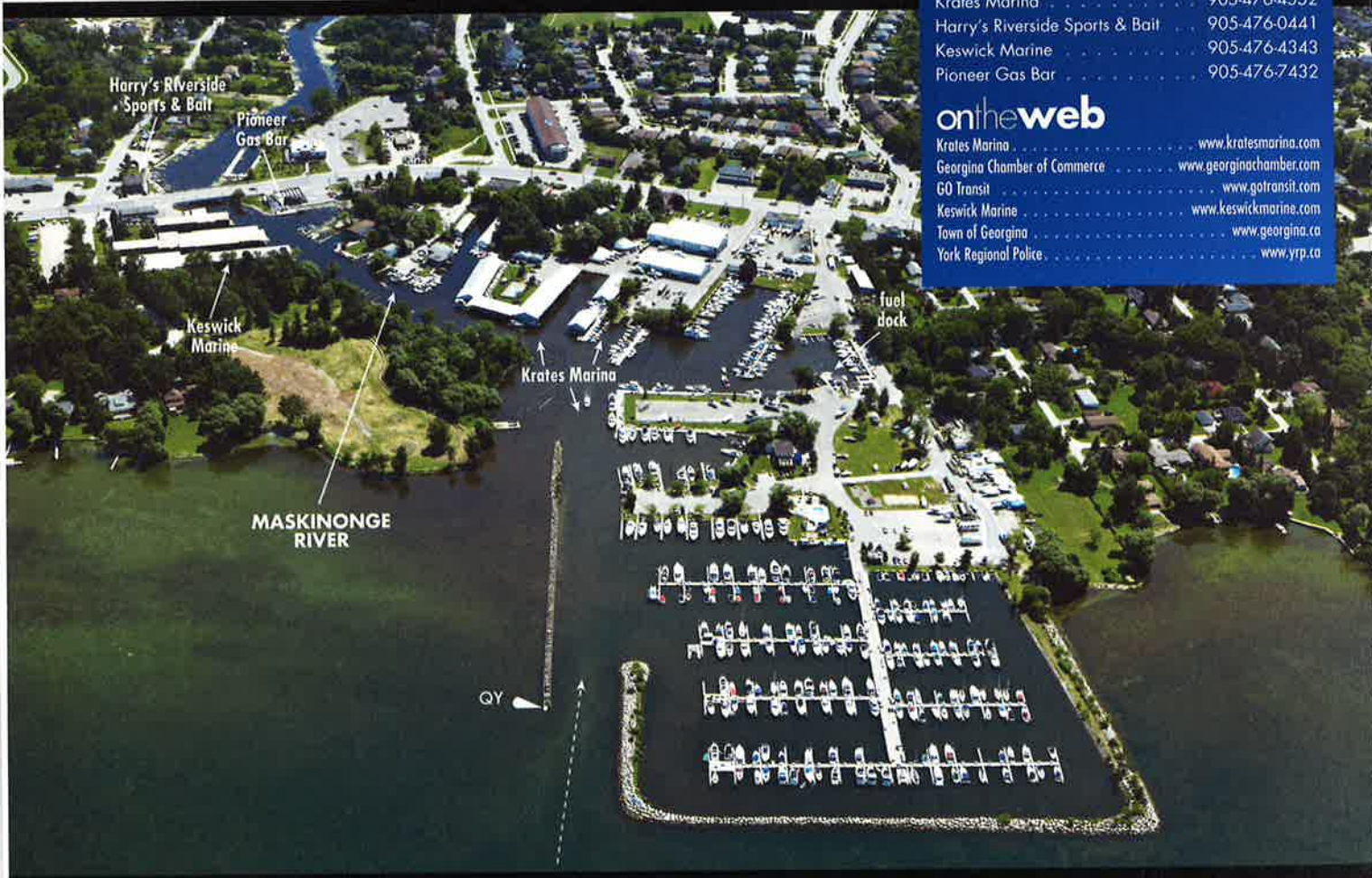
Chart 2028: Krates Marina, a 500-slip facility sits on a 40-acre complex at the mouth of the Maskinonge River.

WAYPOINT # _____ 0.4 kilometre (1/4 mile) N of entrance to Maskinonge R.: 44°13.55'N; 79°28.75'W