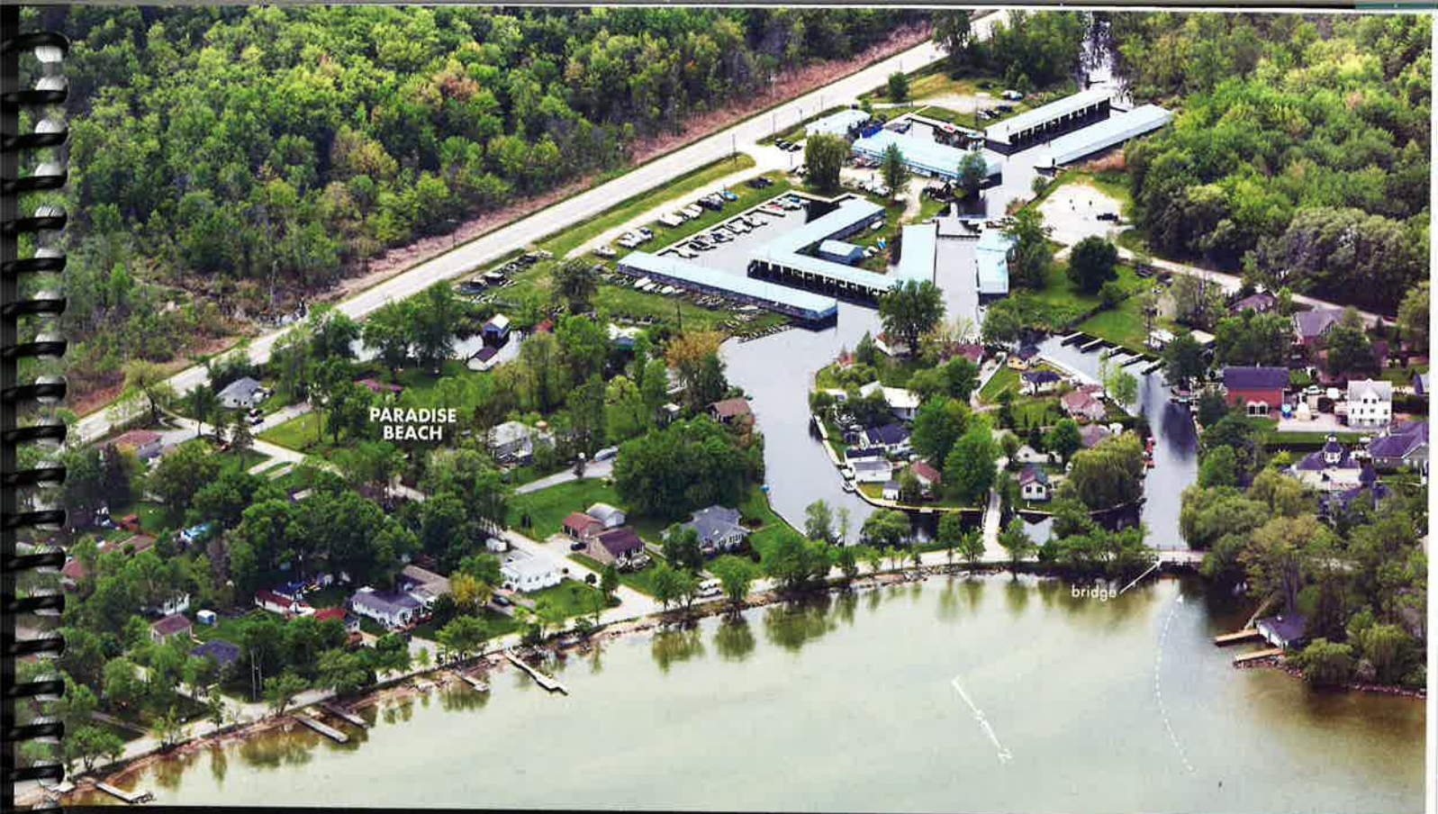
Paradise Beach: The marina here was out of business as of our press time (2016).