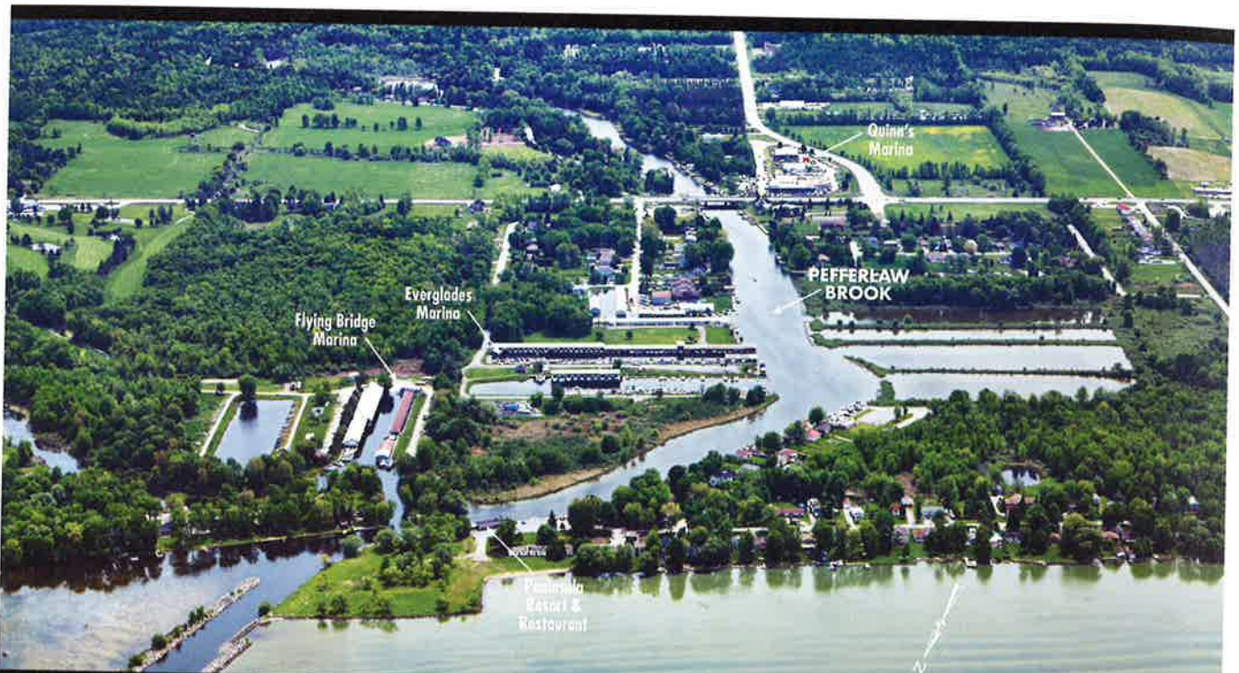
The first two marinas and the resort have overnight dockage. Quinn's offers service only, no dockage.