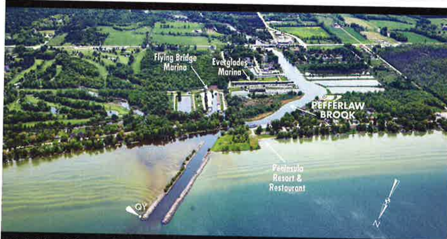
Peninsula Resort & Restaurant offers two hours of free docking to patrons. Flying Bridge and Everglades marinas both welcome transient boaters.