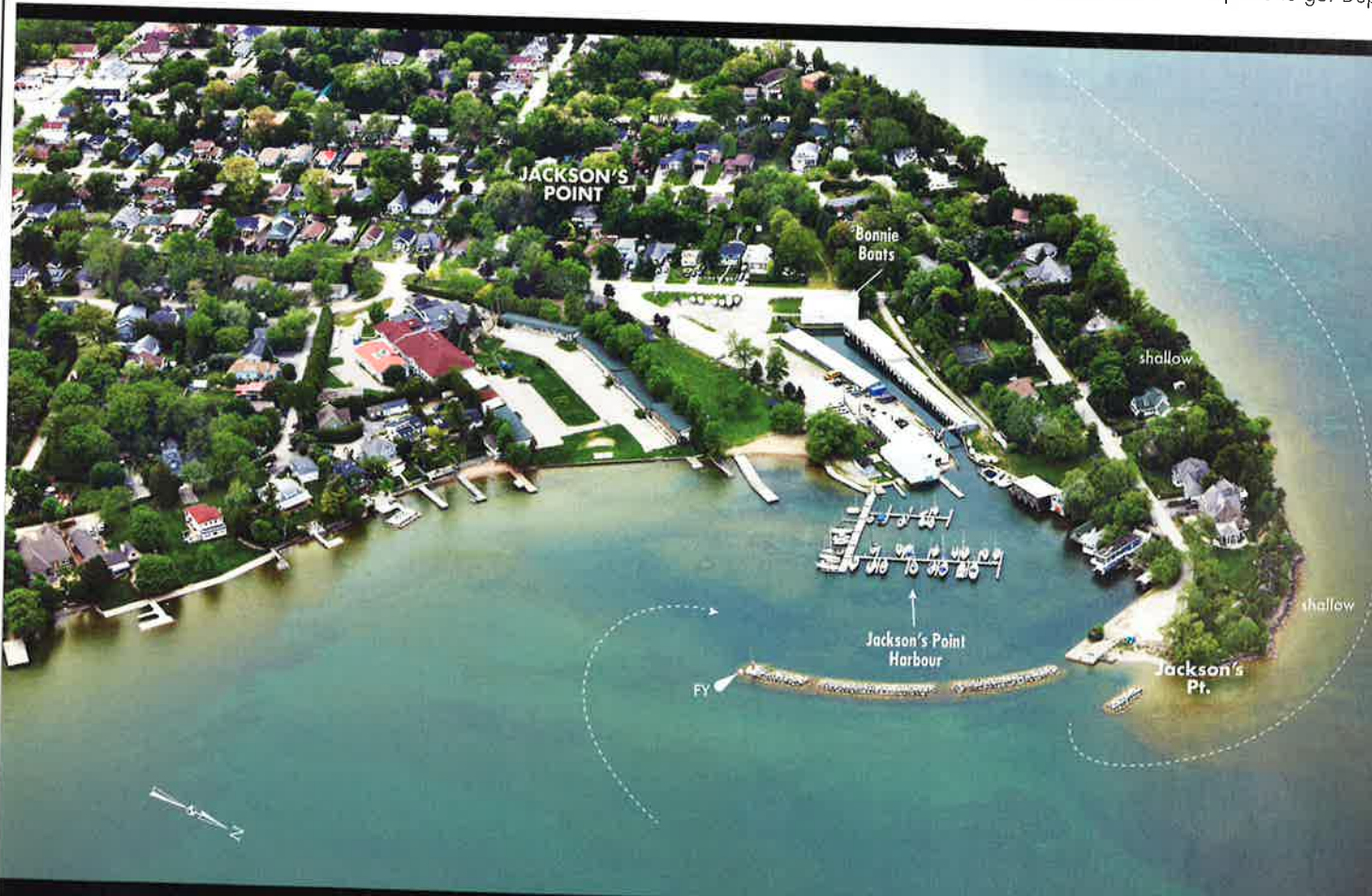
Jackson's Point Harbour: Reserve a slip and plan dinner out.

If you need marine services in Jackson's Point, Bonnie Boats is the place to go. Depth