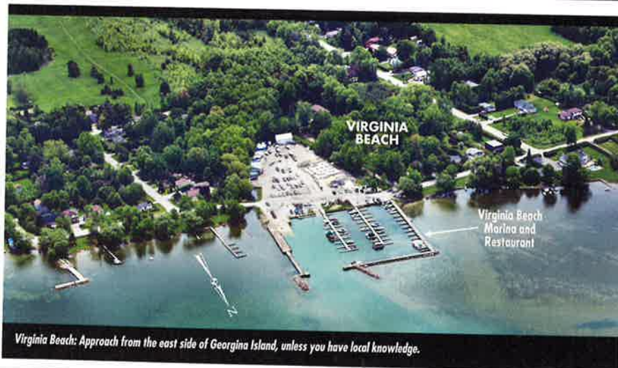
Virginia Beach: Approach from the east side of Georgina Island, unless you have local knowledge.

docks, water (at the fuel dock), washrooms (available during restaurant hours only), ice, launch ramp, vehicle/trailer parking.