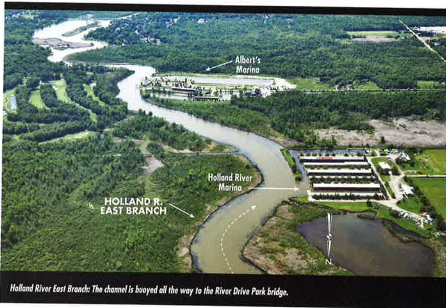
Holland River East Branch: The channel is buoyed all the way to the River Drive Park bridge.