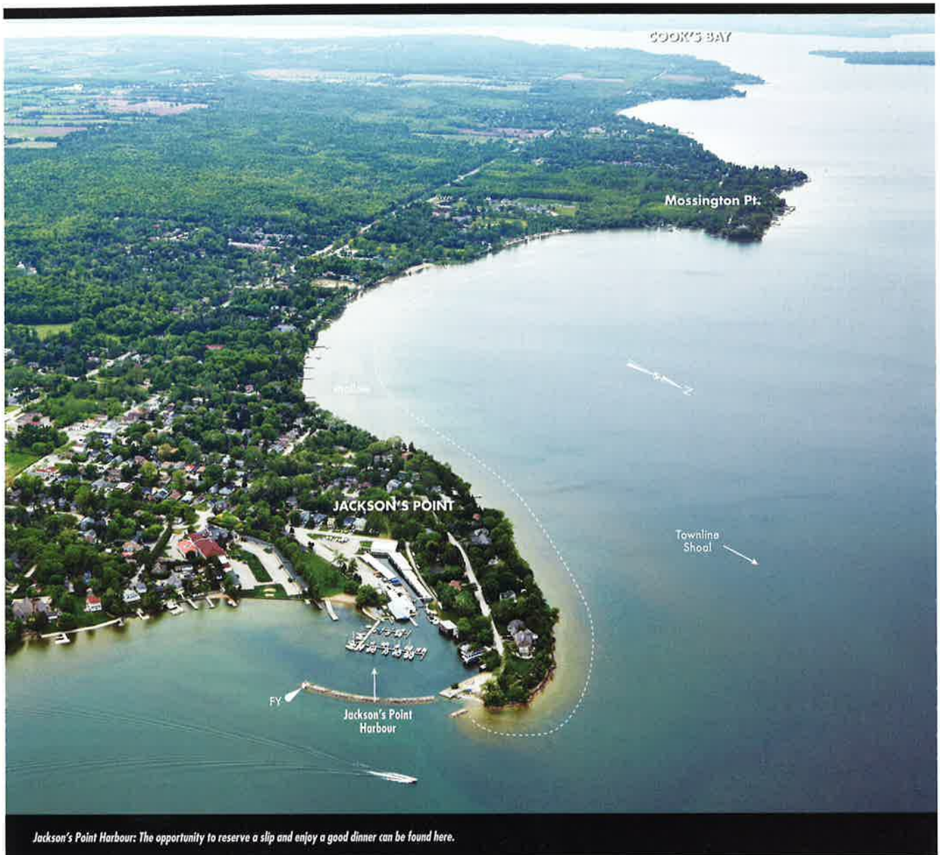
Jackson's Point Harbour: The opportunity to reserve a slip and enjoy a good dinner can be found here.

at the gas dock is 5 feet, but the marina is accessible only to powerboats, since there is a bridge with 12-foot clearance at its entrance. Bonnie Boats repairs fibreglass, outboard and sterndrive engines and props. A marine store carries parts and accessories, as well as cleaning supplies, charts and bait and tackle.